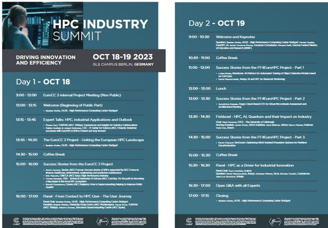
Figure 2: Agenda of the HPC Industry Summit

For the communication of the conference, a visual identity has been created for the dissemination of the event (see Figure 3):