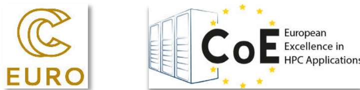
Figure 1: EuroCC and hpccoe main logos

The second goal foreseen in the initial strategy was to create an umbrella brand for the EuroCC and hpccoe brands. However, seen that updating and maintaining the hpccoe brand requires more effort than initially estimated and not to overburden the new CoEs with too much branding work, creating and implementing the umbrella brand is on hold for now. This leaves the two main goals: